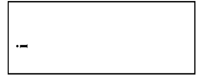
Deluxe Board i